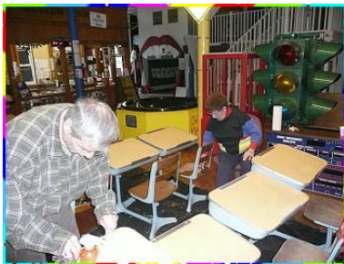
A Multi-Club & Multi-District "Journey of the Desks" Project. View the journey on our website