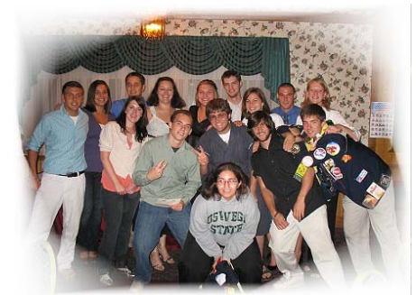
Our Rotaxer's at the 8-07 Welcome Home Dinner

The goals of furthering international goodwill and understanding by enabling students to study first hand some of the accomplishments and problems of people in lands other than their own are critically needed in today's world. Kudos to all who take part in this.