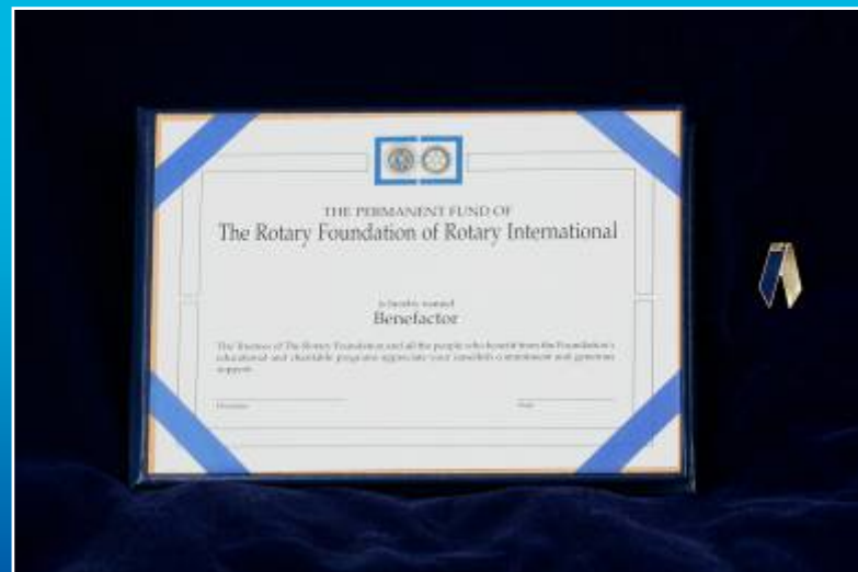
Benefactor Commitment Card: 149-EN