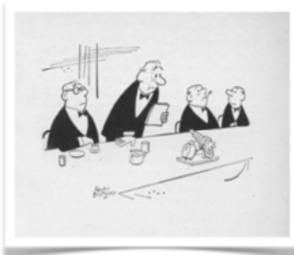
Right Ward, you have 3.6 minutes