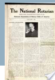
January 1911 Issue of the Original Rotary magazine