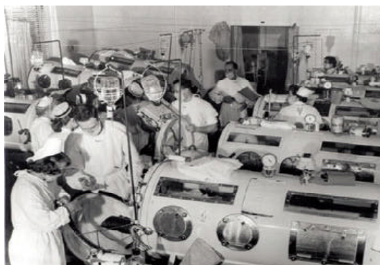
Iron lungs keep polio victims alive in the 1950s.

The polio virus is now circulating in just seven countries around the world, reduced from more than 125 when the campaign was launched in 1988. The seven countries with highest to lowest risk are: India, Nigeria, Egypt, Pakistan, Afghanistan, Niger and Somalia. . - Bruce Frassinelli is publisher & editor of The Promise-Keeper.