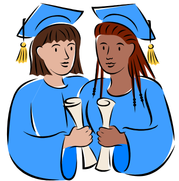
Congratulations to all the graduates of 2004!!