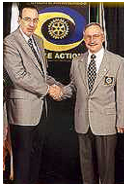
The Changing of the Rotary Guard

Check the Worldwide Rotary Database on our District website & Read Credo Online!